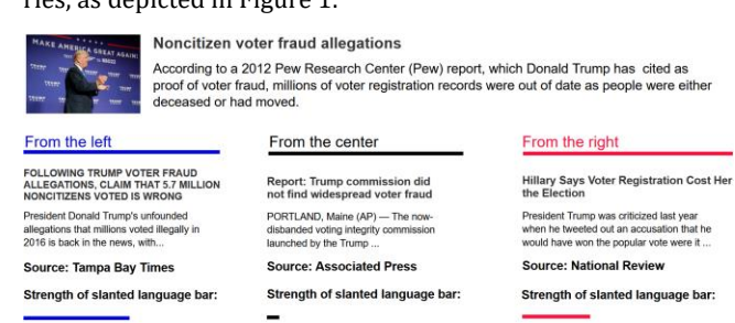
Figure 1: Excerpt from the news overview page.

The workflow of the study is as follows. First, participants answer the previously described questions on their background. Second, we randomly assign respondents (1) to an order of three pre-selected topics (to mitigate any influence of the order in which topics are viewed [15], (2) to seeing the overview visualization or not (to measure contribution C2), and (3) to one of the four article visualizations (to measure C3). The design of the overview follows allsides.com, per topic showing three articles that are representative of three political categories, as depicted in Figure 1.