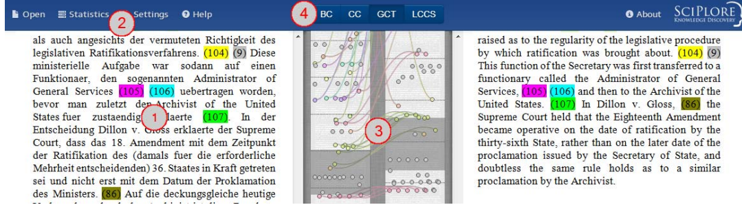
Figure 1: Screenshot of CbPD prototype (left plagiarized translation, right source document)

{gipp, meuschke, lipinski, breitinger}@berkeley.edu, andreas.nuernberger@ovgu.de